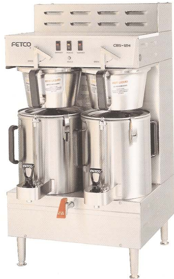
CBS-12H in Stainless Steel finish and with two 1.5 gallon insulated satellite servers